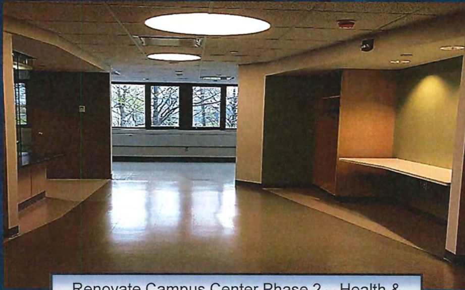
Renovate Campus Center Phase 2 – Health & Wellness ($1.4 Million)