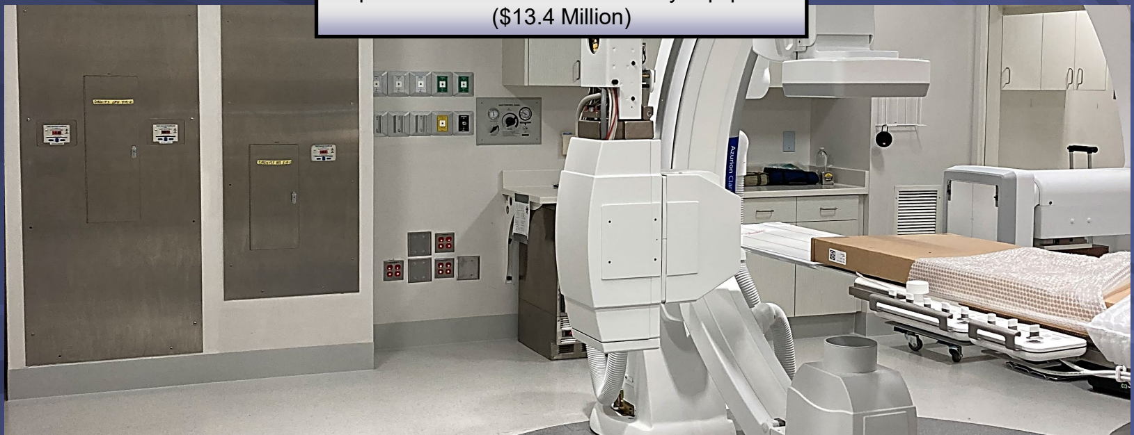
University Hospital at Stony Brook