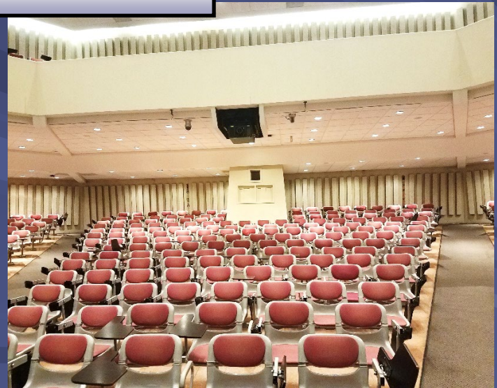
University at Stony Brook