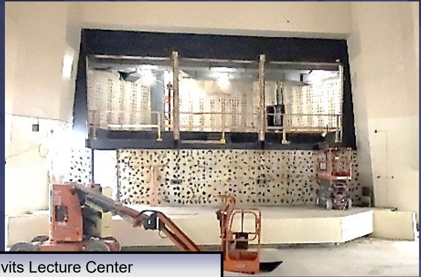
Rehabilitate Javits Lecture Center ($34.1 Million)